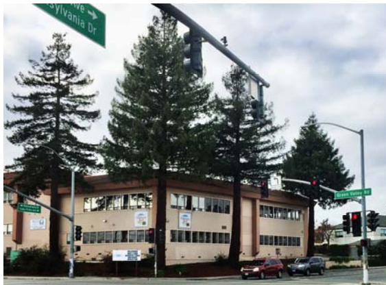
The California Grill sits on Penny Lane, along with a number of other businesses.

located among commercial buildings overlooking the Home Depot on Green Valley Road. Despite the odd location, the food more than makes up for the lack of a view. The entire wait staff from bus boys to servers is cheerful, helpful and a delight.