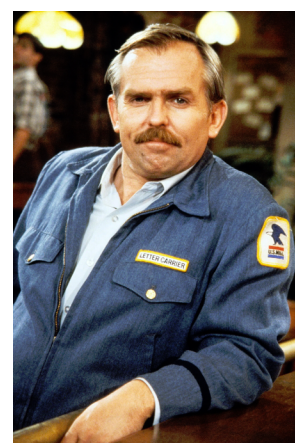
John Ratzenberger, who played beloved mailman Cliff Clavin on the hit comedy "Cheers"

https://about.usps.com/who-we-are/postal-history/famous-postal-workers.pdf