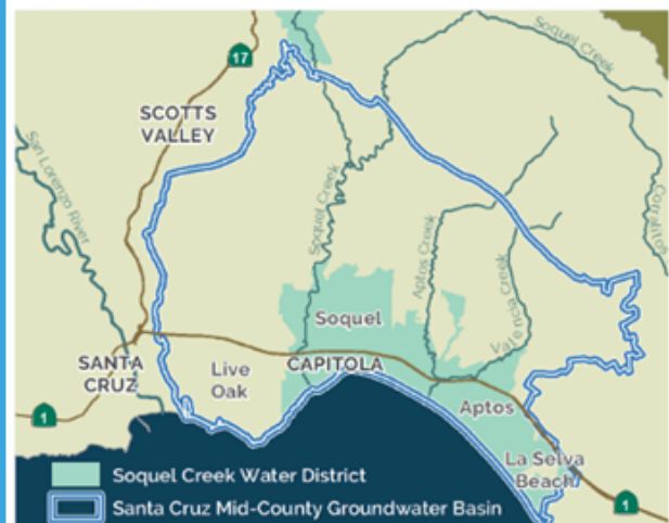
The Santa Cruz Mid-County Groundwater Basin and Soquel Creek Water District boundaries are depicted in this map.