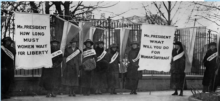
College day in the picket line