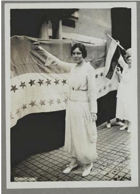
Alice Paul

In 1920, due to the combined efforts of the NAWSA and the NWP, the 19th Amendment, enfranchising women, was finally ratified. This victory is considered the most significant achievement of women in the Progressive Era. It was the single largest extension of democratic voting rights in our nation's history, and it was achieved peacefully, through democratic processes.