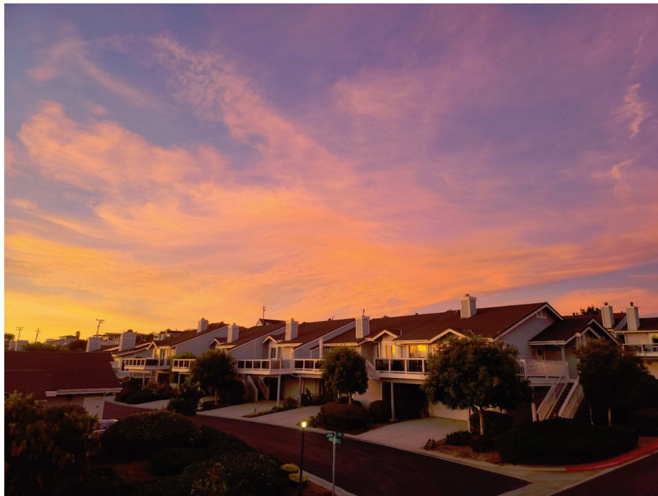
The sunset lights up the sky in swirls of yellow, orange and pink above homes in CDS, turning parts of the sky purple.