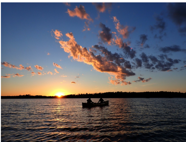
White Iron Lake at sunset; Ely, MN

P.S. Don't forget to send me your book recommendations, photos of your family, pets and/or travels, recipes and anything (and everything) that helps us to know you better!