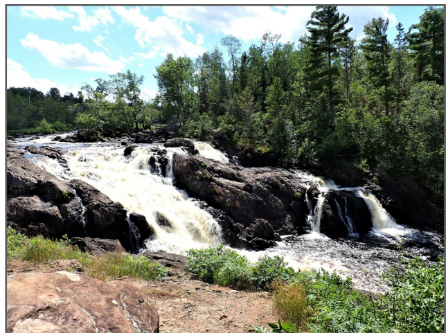
Kawishiwi Falls; Ely, MN