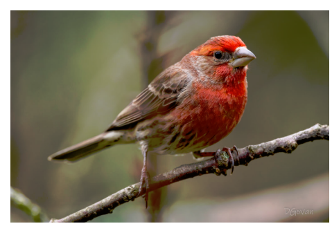
Male house finch. Females do not have any red coloring.

Have you heard a lot of happy bird song this spring? House finches are aplenty in Canon del Sol this season, often coming from the rooftops where their singing can be heard much of the day.